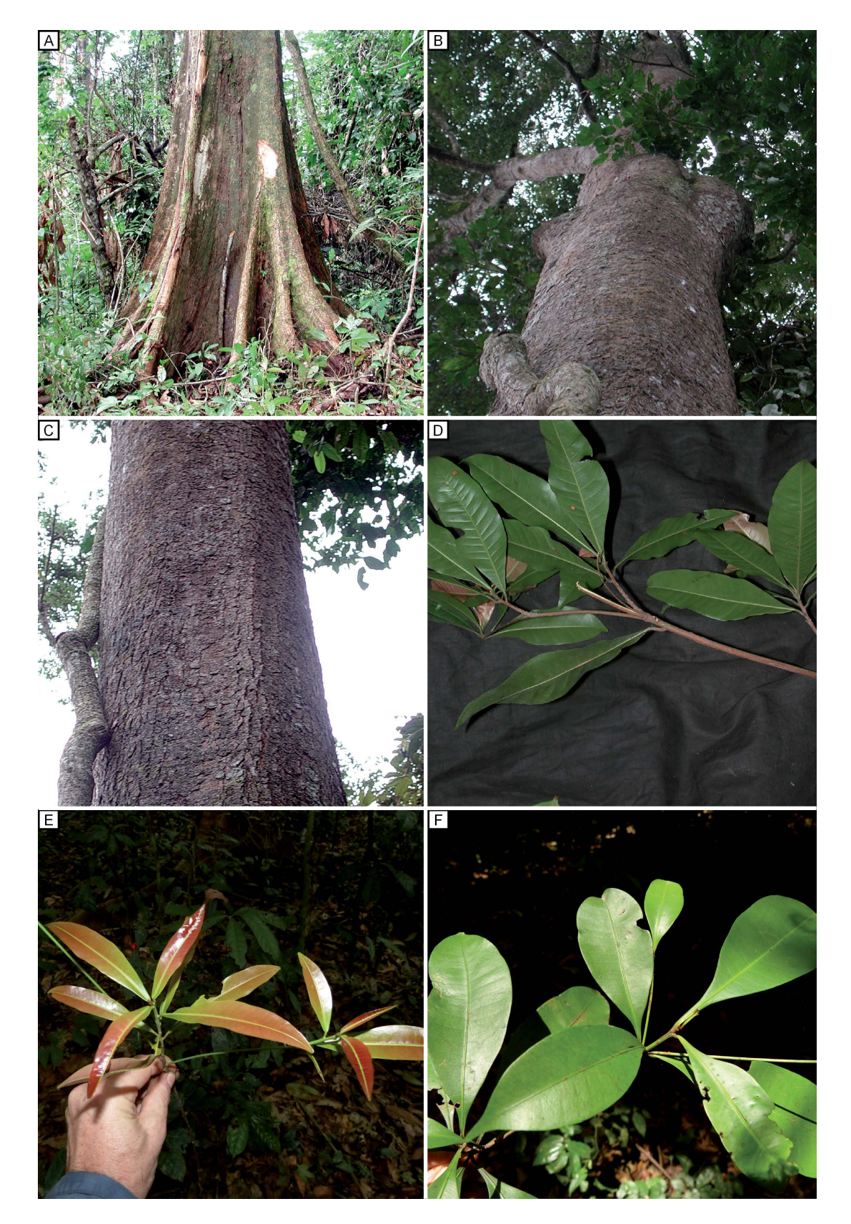
Figure 5 – Synsepalum afzelii : A, buttresses, similar to those of S. ntimii ; B, upper part of bole; C, middle part of (subcylindrical) bole – compare high fluting in S. ntimii (fig. 1); D, branchlet showing reddish new leaves; E, sapling shoot with reddish new leaves. Synsepalum ntimii : F, sapling shoot with green new leaves. A from Hawthorne & Gyakari 201B125 (FHO), B–D from Hawthorne & Gyakari 201a121 (FHO), E from Hawthorne et al. 213A169 (FHO), F from Hawthorne et al. 213A260 (FHO).