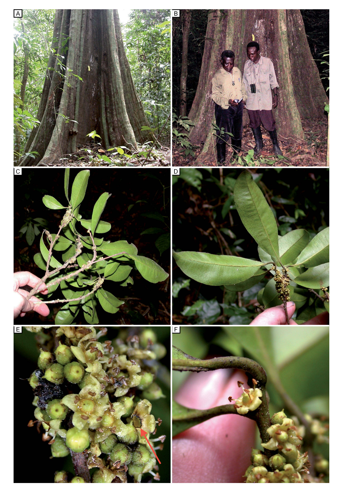
Figure 3 – Synsepalum ntimii : A, buttresses; B, eponymous Ntim Gyakari (left), with J. Dabo, co-collectors, as scale for buttresses; C, flowering branches; D leaf surface and flowering branchlet; E, detail of fascicles showing open flower (centre), flower with falling corolla (arrowed) and older flowers (top left); F, single flower in leaf axil. C–F from Hawthorne & Gyakari 203A024 (FHO).