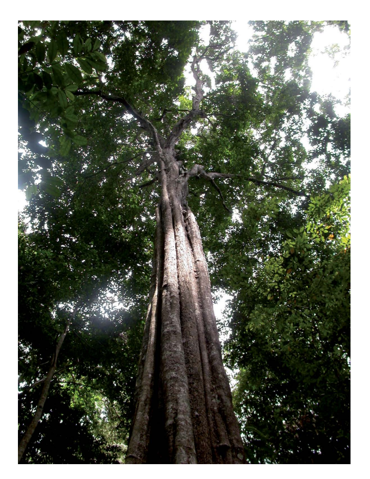
Figure 1 – Synsepalum ntimii : fluted bole and crown, in Cape Three Points F.R., Ghana.

Specimens (normally sterile) associated with Rapid Botanic Survey (RBS) originally alerted the author to the new species. Orthodox herbarium collections were made when fertile individuals were found. Older specimens, either unidentified or previously named, were sought across potential genera in herbaria (GC, FHO, K, WAG) and online via JSTOR Global Plants (http://plants.jstor.org); however no existing unidentified or misidentified specimens amongst other species were found in the herbaria. The fertile types have been distributed to several herbaria. Photographs taken during the collection of the type specimen have proved useful for adding to the description, and for publicising the new species for conservation purposes. In 2013, known localities in Ghana were revisited and leaf specimens collected both as orthodox herbarium collections and fragments were placed directly in silica gel for DNA analysis (marked as '(DNA sample)' with the cited specimens below).