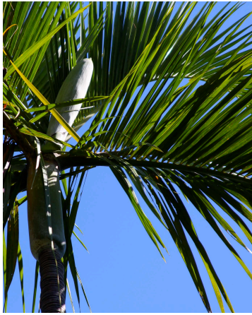
Dypsis saintelucei, IUCN Critically Endangered