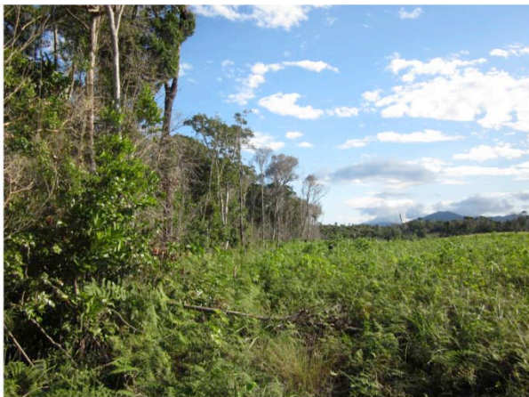
The edge of the littoral forest at Sainte Luce facing the encroaching agricultural fields of cassava.

The botanical composition and structure of the Sainte Luce littoral forest fragments is unique and complex, containing plant species found nowhere else (Rabenantoandro et al., 2008). During early 2011 (Jan – Mar) ACP volunteers completed habitat sampling research in fragments S8 and S9 to determine the overall vegetative composition of the fragments by recording variables within representative plots throughout each forest – a project that started in 2010. This baseline information is a useful reference point when investigating distribution of fauna and can help in identifying habitat requirements for individual species. Notably, habitat preferences will also be determined for species of flora found in Sainte Luce, including the two Critically Endangered palms that the ACP studies.