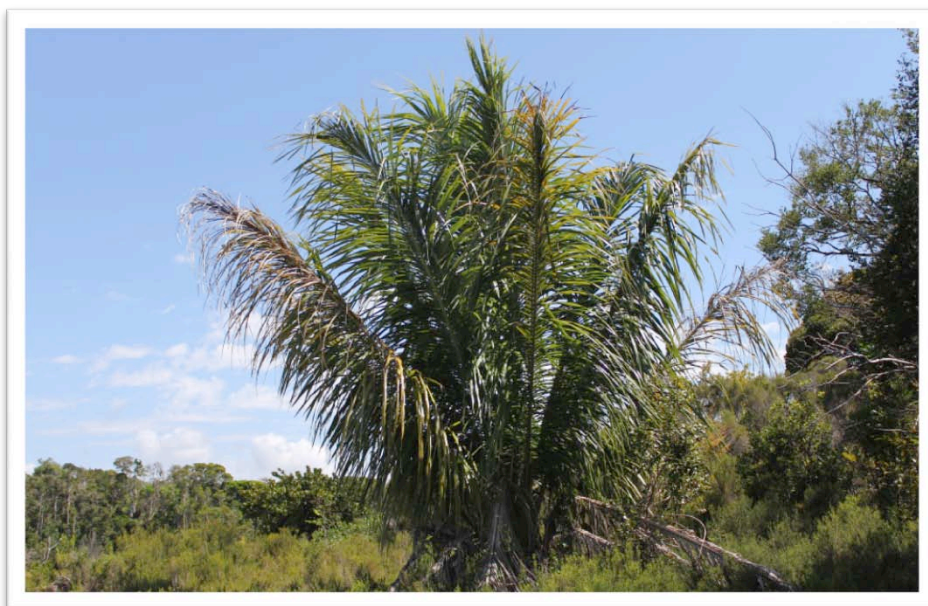
Beccariophoenix madagascariensis , outside forest fragment S8

Knowledge acquired during the palm mapping programmes and from working closely with the Sainte Luce Tree Nursery, as well as interviews with the fishermen on forest resource usage, has provided incredible insights into the palm flora and its close relationship with the local people.