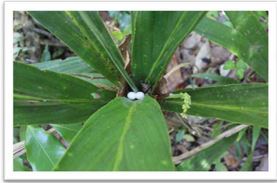
Phelsuma eggs laid in D. brevicaulis

Dypsis brevicaulis is an unusual palm. It is a short-stemmed dwarf palm with entire bifid leaves and is incredibly rare - only found amongst the lowland coastal forests of southeastern Madagascar; more specifically, Manantenina, Tsitongambarika and Sainte Luce. Only fifty individuals have been seen in the wild. Dypsis brevicaulis is listed as Critically Endangered by the IUCN Red List and is subject to ongoing threats of habitat loss and fragmentation.