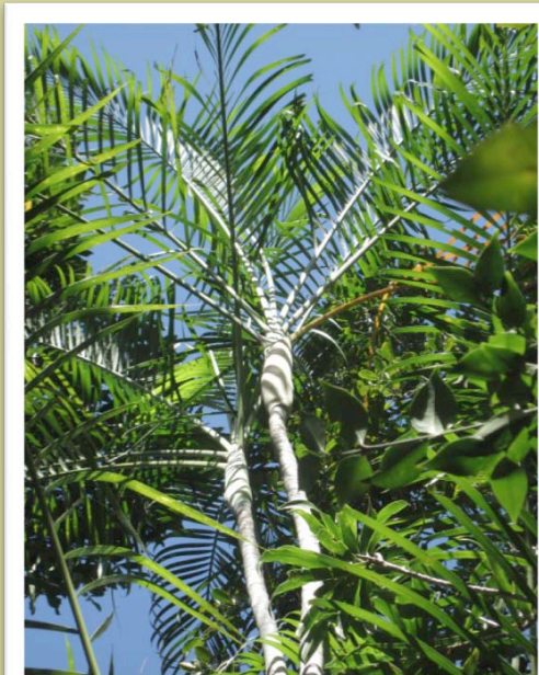
Dypsis psammophila , a slender clustering palm and is well adapted for life on the sandy soils of Sainte Luce. Its name ( psammophila ) means sand-loving.

During October the ACP gathered morphological descriptions and photographs to be sent to an expert at KEW Botanical Gardens for identification. The response confirmed the palm to be Dypsis psammophila , up till now unrecorded in Sainte Luce. This is an exciting discovery but further work needs to be carried out on its population status, local distribution and local uses by the villages. Descriptions were taken from individuals found in S8.