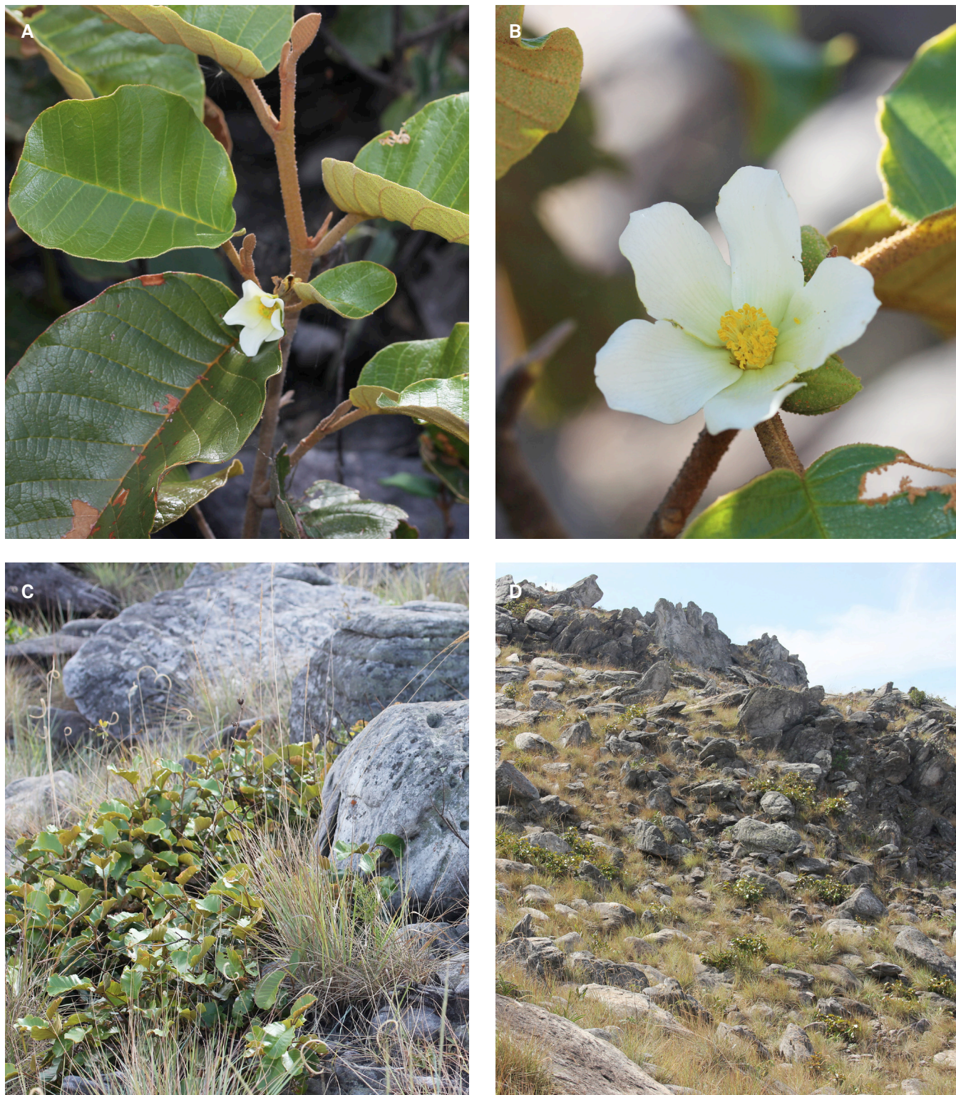
Fig. 2. – Photographs of Pentachlaena vestita Andriam., Lowry & G.E. Schatz. A. Flowering branch; B. Close-up of flower (note dense indument on lower surface of leaf); C. Adult plant; D. Habitat of type locality, with open wooded grassland and bushland/Tapia woodland and rocky quartzite substrate.